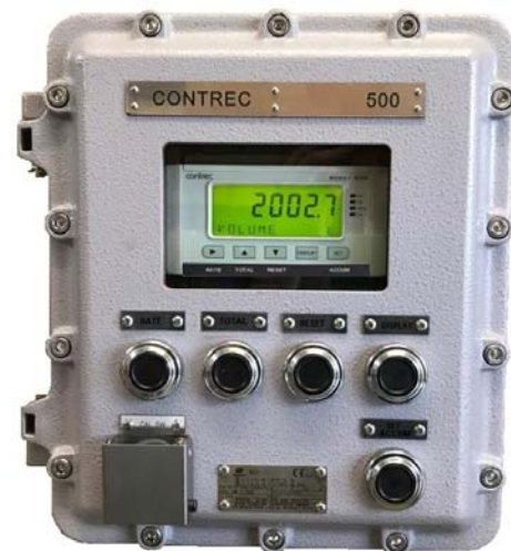
Example of 500 Series in BZC Ex d enclosure