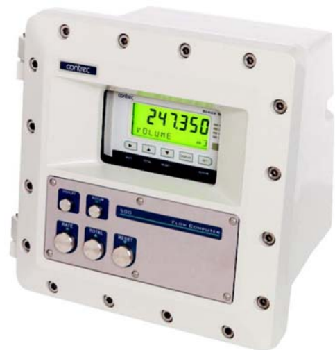
500 Series in Ex410 Enclosure